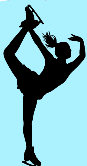
Figure skates are mandatory. Looking for ones with good ankle support. They should be firm. If they collapse or crease by the ankle they lack support. Sharpening skates regularly from places that know how to sharpen figure skates is important. Ask your coach for places they recommend.